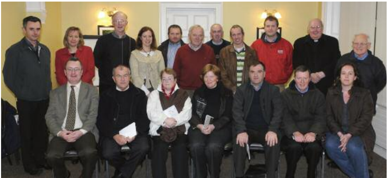
Members of the Pastoral Area Coordinating Group for Pastoral Area 7 at their first meeting in the Parish Centre, Bandon, on Dec 3rd, 2009.