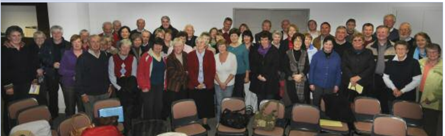
At an inter-parish pastoral area meeting in the Carmelite Friary, Kinsale, were clergy, parish finance committees and parish assembly members from the four parishes of Ballinhassig, Clontead, Courceys and Kinsale who make up Pastoral Area 2.